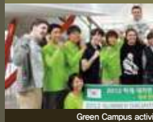
Green Campus activity_Edge Hill University, UK