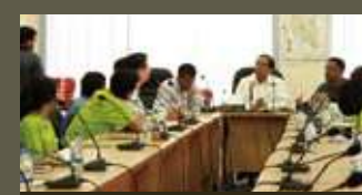
Seminar with Dhaka city hall, Bangladesh