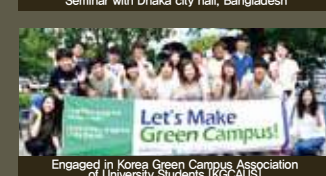
Engaged in Korea Green Campus Association of University Students (KGCAUS) (in which 50 Korean environmental clubs are enrolled)

Daejayon carries out worldwide exchange activity to establish university student environmentalists' network and make Green Campus.