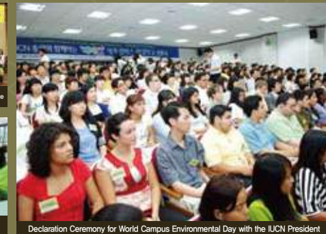
Declaration Ceremony for World Campus Environmental Day with the IUCN President