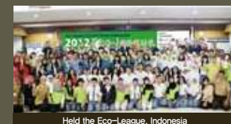
Held the Eco-League, Indonesia