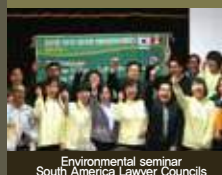
Environmental seminar South America Lawyer Councils