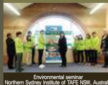
Environmental seminar Northern Sydney Institute of TAFE NSW, Australia