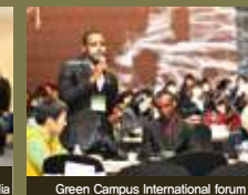
Green Campus International forum