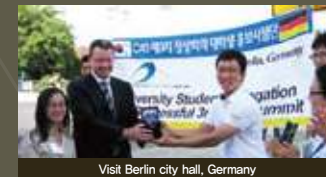
Visit Berlin city hall, Germany