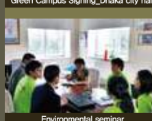
Environmental seminar Ulaanbaatar University, Mongolia