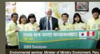
Environmental seminar_Minister of Ministry Environment, Peru