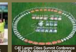
C40 Large Cities Summit Conference Publicity delegation-international