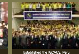
Established the IGCAUS, Peru