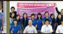
Environmental seminar_Tokyo city hall, Japan