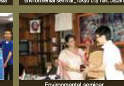
Environmental seminar Mumbai city hall, India