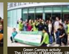
Green Campus activity The University of Manchester, UK