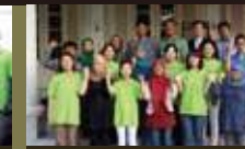
Meeting with the mayor of Jakarta, Indonesia