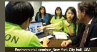
Environmental seminar_New York City hall, USA

Korea Water Resources Corporation The National Council of Youth Organizations in Korea Korea Youth Work Agency Korea Ocean Research & Development Institute Korea Environment Institute Korea Environmental Preservation Association C40 Large Cities Climate Summit