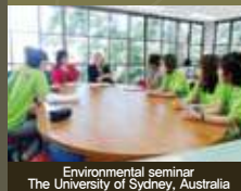
Environmental seminar The University of Sydney, Australia