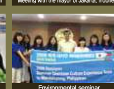
Environmental seminar Mandaluyong city mayor, Philippines