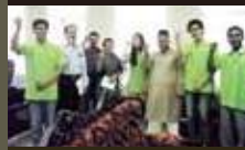
Green Campus Signing_Dhaka city hall